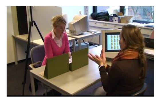
Figure 3. Setup of the experiment, matcher sits on the left and director sits on the right.

The experiment was performed in a lab, where the director and the matcher were seated at a table opposite each other (see Figure 3 for the setup).