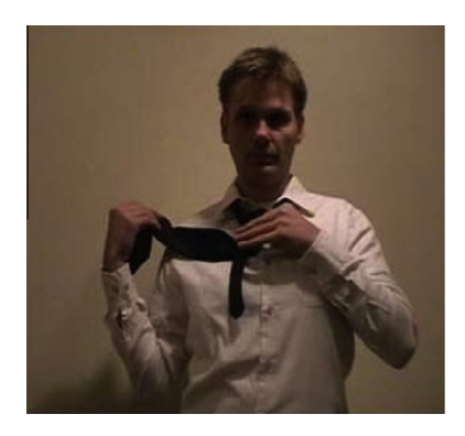
Fig. 1. Still of the beginning of a fragment of one of the stimulus clips, in this case accompanied by the phrases 'behind' and 'up'.

M. Hoetjes et al. | Speech Communication 57 (2014) 257-267