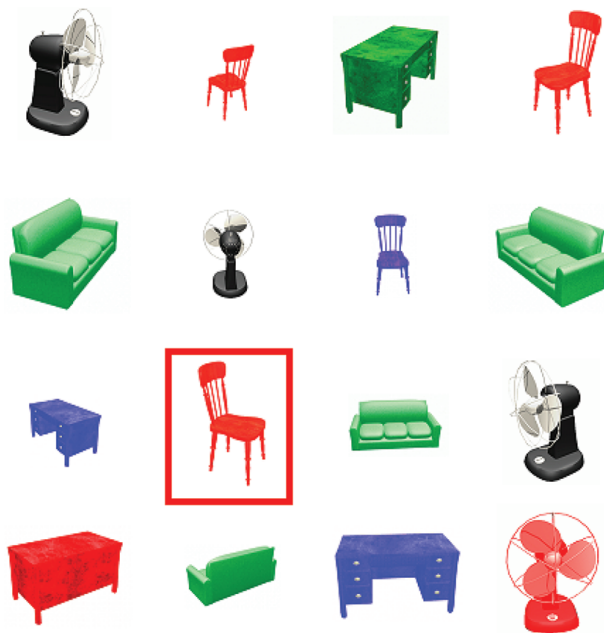
Figure 2. Example of a furniture picture grid. The object with the red square surrounding it is the target object of that particular trial.