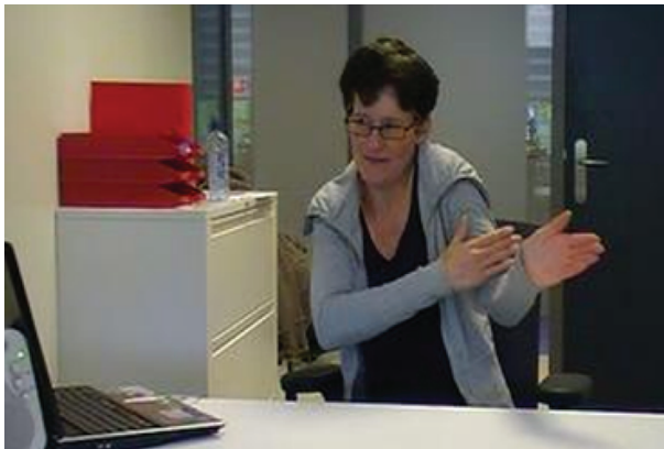
Figure 3. Camera view of the director, camera is positioned behind the matcher.

The director and the matcher faced one another across a table. A camera was positioned behind the matcher filming the upper body and hands of the director (see Figure 3 for an example).