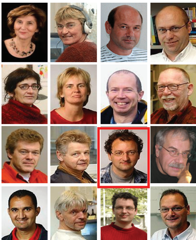
Figure 1. Example of a people picture grid. The picture with the red square surrounding it is the target object of that particular trial.

Two picture grids, each containing 16 pictures, were used by each director. For each picture grid used by the director, an alternative grid was constructed for the matcher, containing the same items as on the director's picture grid, but for the matcher, the items were numbered and presented in a different order (for example grids, see Figures 1 and 2). The picture grids showed either pictures of people or of furniture items. The two different domains (people and furniture) were used since previous studies on referring expressions had shown them to be efficient domains for making people produce referring expressions (Koolen, Gatt, Goudbeek & Kraemer 2011; Van Deemter, Gatt, van der Sluis & Power 2012; Van der Sluis & Kraemer 2007). The items of the furniture picture grid were the same as those used in the TUNA and D-TUNA corpus (Koolen et al. 2011; Van Deemter et al. 2012); the items of the people picture grid were inspired by the items from the people domain in these same corpora.