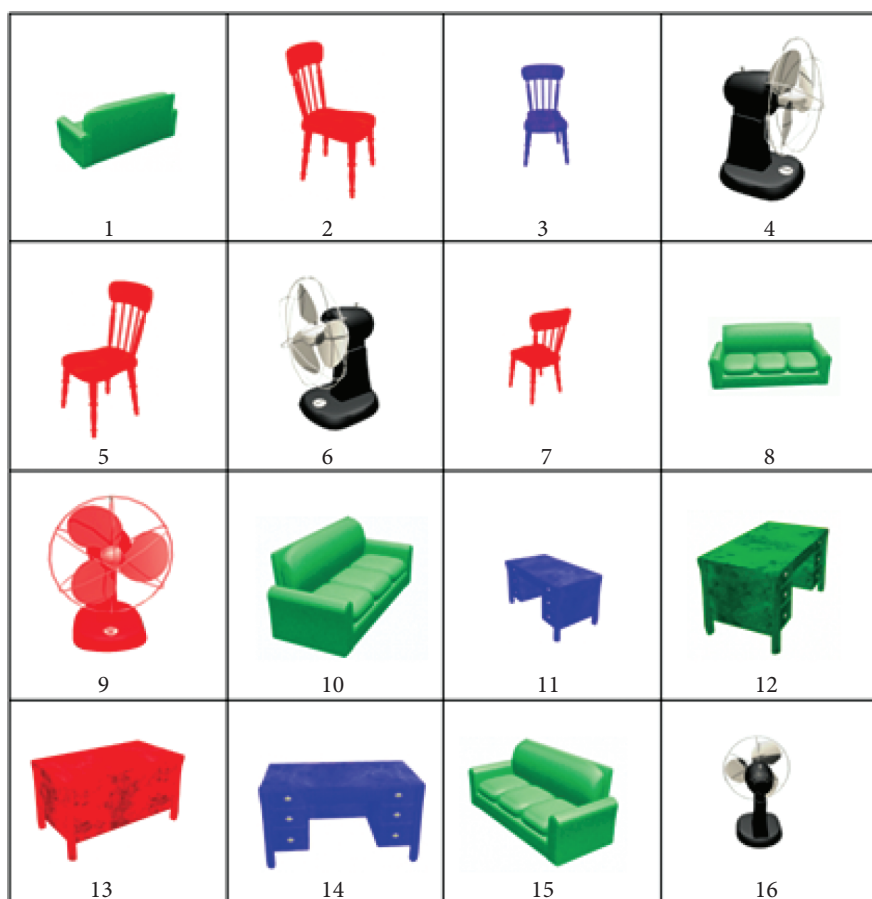
Figure 4. Picture card of one of the furniture grids as presented to the matcher.

The director had a laptop screen to his or her side and the matcher had a picture card in front of him or her. The director and matcher could see each other directly, but could not see each other's screen or card. The participants were given written instructions and had the opportunity to ask questions to the experimenter, after which the experiment started. The director was then presented with a trial on the computer screen (as in Figures 1 and 2). The director was asked to provide a description of the target object in such a way that the matcher could distinguish it from the 15 distractor objects. The matcher had a picture card filled with 16 numbered objects (see Figure 4 for an example) in front of him or her, which was not visible to the director. The matcher's card showed the same objects as on the director's screen, but these objects were ordered differently for the director and the matcher and only the matcher's objects were numbered. The difference in ordering meant that the director could not use the location of the target object on the grid