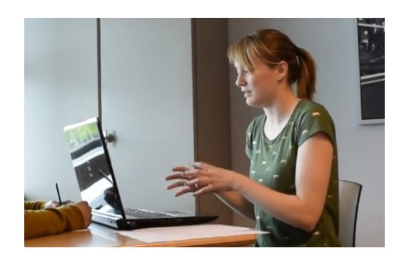
Figure 4. Example of participant producing a gesture with an object-incorporating handshape. The participant was describing the placement of a bowl, by saying (gesture during underlined part) "she puts it on the <u>right</u> side of the desk".