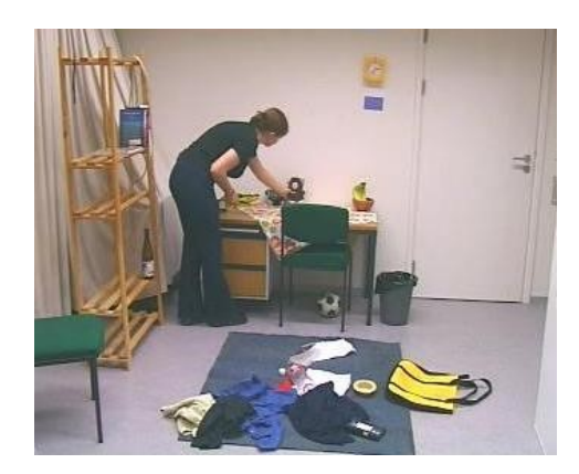
Figure 1. Screen shot from one of the stimulus videos.