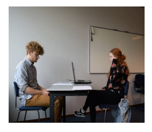
Figure 2. Experimental setup with the Drawer on the left and the Describer on the right

The analyses were based on the speech and gesture in the placement event descriptions provided by the Describer. The experiment took part in L2 English, and no mention was made of gestures. Participants were debriefed at the end of the experiment.