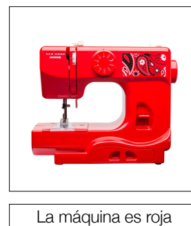
Figure 1: Example of an experimental item containing the cognate 'máquina'.

illustrating the meaning of the sentence, to help participants further understand the semantic meaning of the sentence, and to make the task more interesting (see Figure 1). Half of the sentences were experimental items that contained a cognate in which a different syllable is stressed than in its Dutch counterpart, either with a written accent (e.g., in Spanish: Los cardiólogos son inteligentes vs. in Dutch: De cardiologen zijn intelligent ) or without a written accent (e.g., in Spanish: El radiador es moderno vs. in Dutch: De radiator is modern ). The other half of the sentences were filler items that contained a cognate in which the same syllable is stressed in its Dutch counterpart, either with a written accent (e.g., in Spanish: Los números son romanos vs. in Dutch: De nummers zijn Romeins ) or without a written accent (e.g., in Spanish: La universidad es grande vs. in Dutch: De universiteit is groot ). The cognate always appeared as the second word of the sentence. For this paper, the filler items were not analysed.