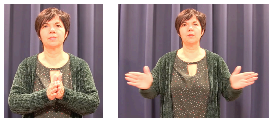
Figure 3: Stills from training video in AV-M condition showing an example of the metaphoric gesture.