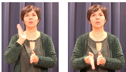
Figure 2: Stills from training video in AV-B condition showing an example of a beat gesture.