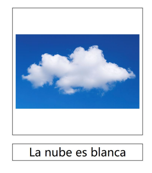
Figure 1 : Example of an experimental item containing the target phoneme /u/.

understand the semantic meaning of the sentence, and to make the task more interesting (see Figure 1). Half of the sentences had a word containing the target phoneme as the second word of the sentence. The target phoneme always occurred in the first syllable of this two-syllable word (e.g., La nube es blanca, La zeta es verde ). Each target phoneme occurred in four target words. The remaining eight sentences were fillers, containing the phonemes of interest, but at a different position either within the word or within the sentence. For this paper, the filler items were not analysed.